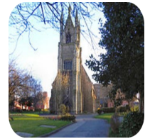
St Joseph's Church Mather Lane Leigh WN7 2PR