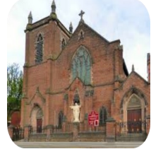
Sacred Heart Church Walmesley Road Leigh WN7 1YE