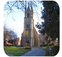
St Joseph's Church Mather Lane Leigh WN7 2PR