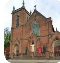
Sacred Heart Church Walmesley Road Leigh WN7 1YE

Served by the Churches of Sacred Heart and St Joseph