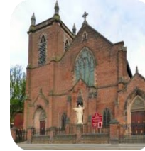
Sacred Heart Church Walmsley Road Leigh WN7 1YE

Served by the Churches of Sacred Heart and St Joseph