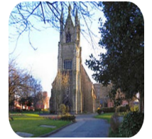
St Joseph's Church Mather Lane Leigh WN7 2PR