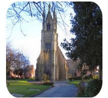
St Joseph's Church Mather Lane Leigh WN7 2PR