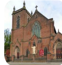
Sacred Heart Church Walmesley Road Leigh WN7 1YE

Served by the Churches of Sacred Heart and St Joseph