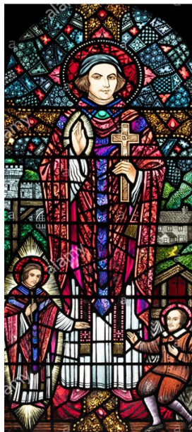
St Edmund Arrowsmith