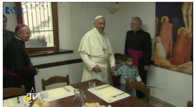
A little boy shows the Pope to his place for lunch in Assisi.

8.00 am Morning Prayer & Opening of Exposition 9.00 am Mass 11.00 am Mass 6.00 pm Evening Prayer & Benediction (to conclude the 40 Hours)