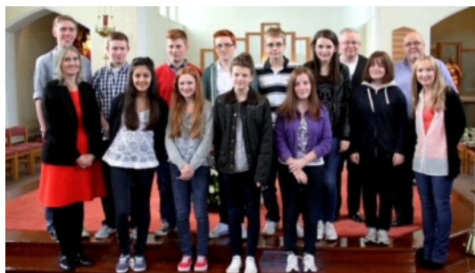
The Youth SVP at a Prayer Relay Service